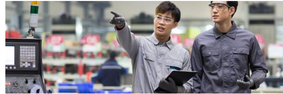
Quality and Business Excellence