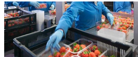
Food and Retail