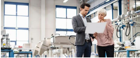
Lead Auditor / Auditor Qualification

training.ph@bsigroup.com | +63 2 8539 0330 | bsigroup.com/en-PH/