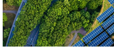
Greenhouse Gas Qualification