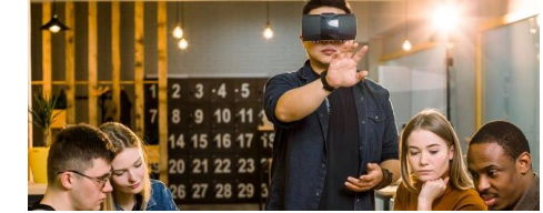
AI Management Qualification