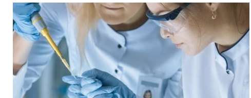
Healthcare and Medical Devices