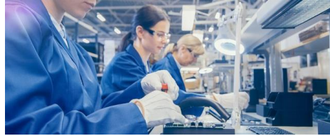
Lean Six Sigma Qualification