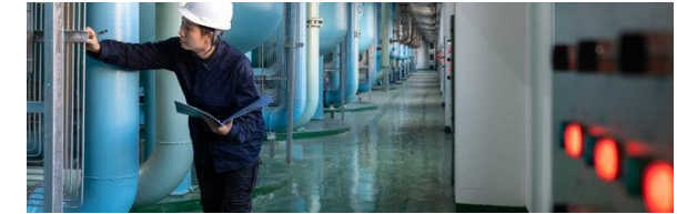
Health, Safety and Wellbeing