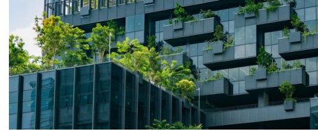
BIM ISO 19650 Qualification